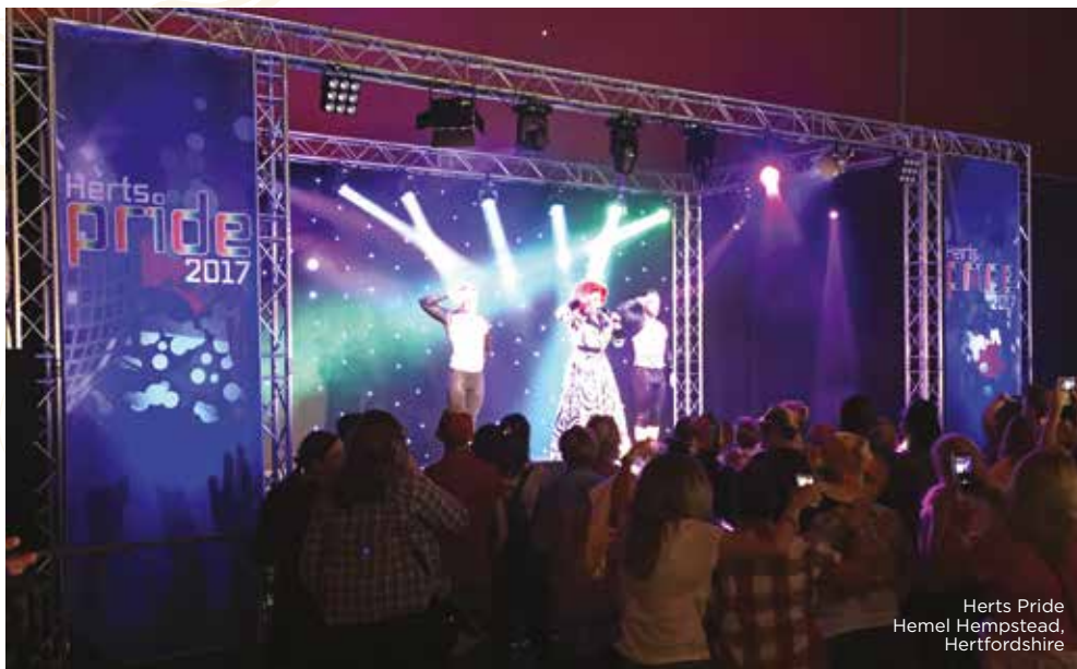
Herts Pride Hemel Hempstead, Hertfordshire