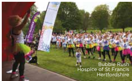
Bubble Rush Hospice of St Francis Hertfordshire

Our team are small enough to care and big enough to cope with the demands thrown at us on outdoor events. Talk to the team who have experience delivering events at this scale.