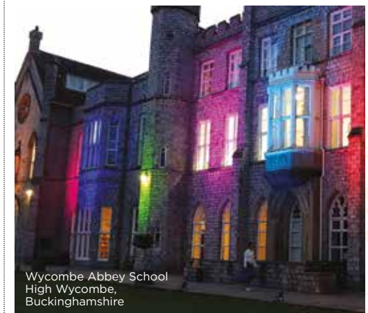
Wycombe Abbey School High Wycombe, Buckinghamshire