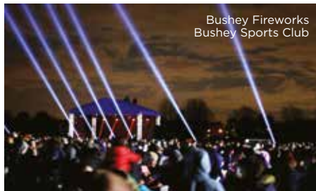
Bushey Fireworks Bushey Sports Club