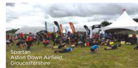
Spartan Aston Down Airfield, Gloucestershire