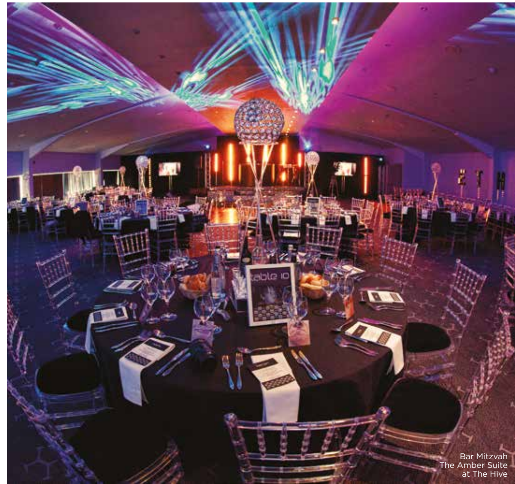
Bar Mitzvah The Amber Suite at The Hive