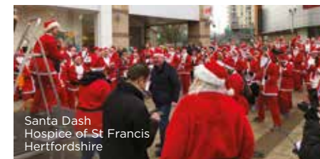
Santa Dash Hospice of St Francis Hertfordshire