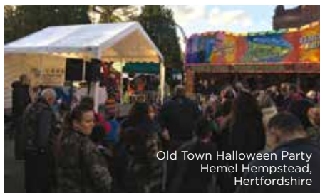
Old Town Halloween Party Hemel Hempstead, Hertfordshire