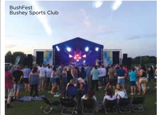
BushFest Bushey Sports Club

We are already working with a number of Charities, Companies & Organisations to help deliver successful events, whether it's just a single match, or the whole cup final.