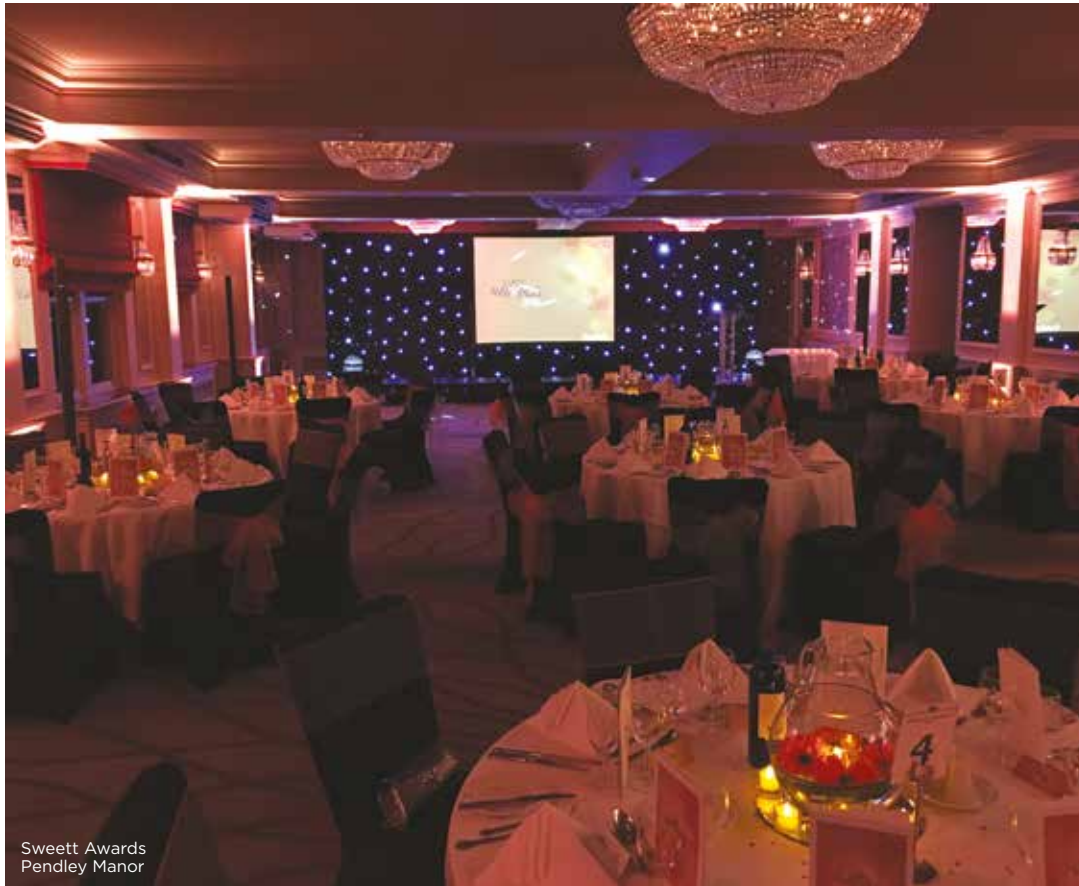
Sweett Awards Pendley Manor