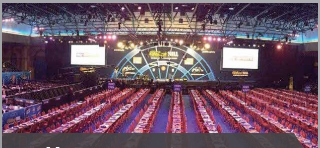
World Darts - Event Carpet