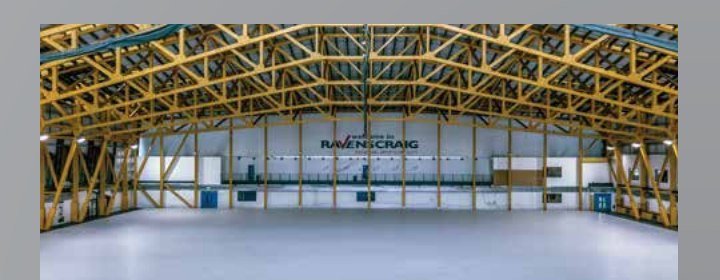
British Transplant Games - Temp-a-Path