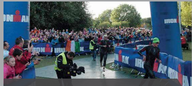
Iron Man UK - Temp-a-Path

Whether you need a temporary access road, modular flooring solution or a fully carpeted exhibition hall, EFS Europe has it covered!