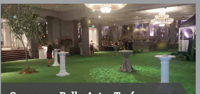
Grosvenor Ball - Astro Turf