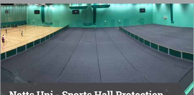
Notts Uni - Sports Hall Protection