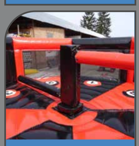
Enclosed Last One Standing