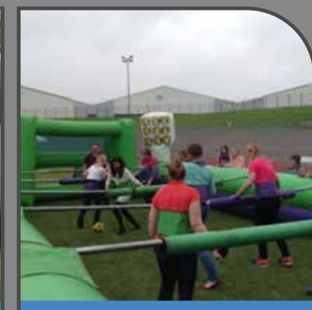
Human Table Football