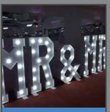
LED "MR&MRS" Letters