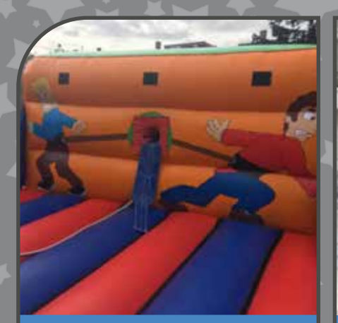
(36ft x 12ft) Eliminator Bungee Run