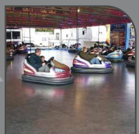
Dodgems / Bumper Cars