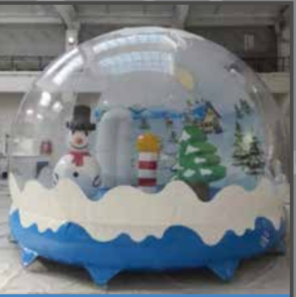
Christmas Bouncy Globe