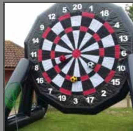
Football Darts Shootout